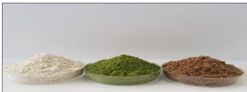
Figure 1. Whole wheat flour, alfalfa concentrate flour and defatted flaxseed flour.

Three samples of mixtures from wheat flour, with different proportions of partially defatted flaxseed flour and alfalfa concentrate were obtained. The types of flour mixtures used in this study are presented in Table 1.