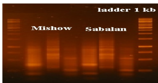
Figure 2. Electrophoresis of the resultant bands from primer E-22 for 3 populations for Mishow region and for 3 populations for Sabalan region